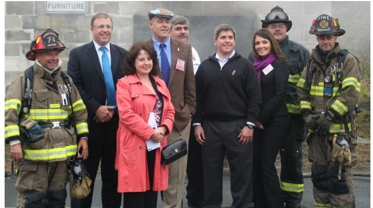
A scene from the October Membership Meeting at the Colonie Town Fire Prevention & Investigation Municipal Training Tower.